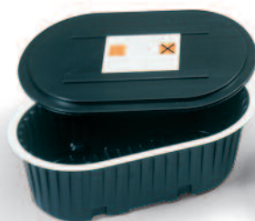
Disposal container with cover