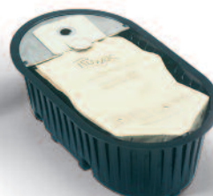
Dust filter bag